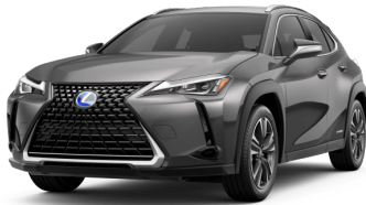
2020 UX 250h AWD